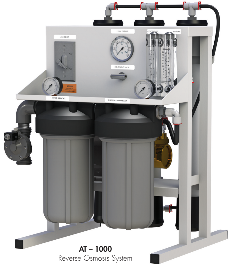
AT – 1000 Reverse Osmosis System

can also be upgraded for higher recovery rates by adding the concentrate recycle option.